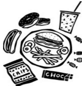
Food and Drinks!